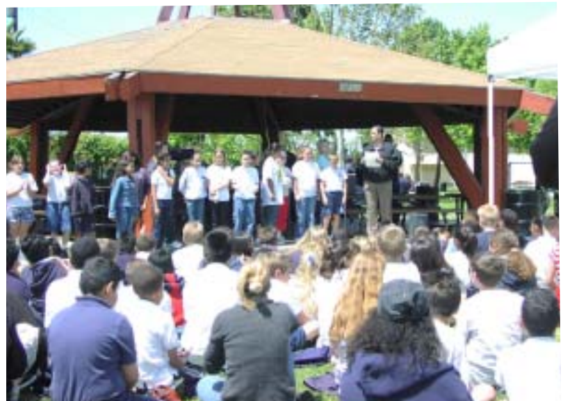
Winners of the Poster and Slogan Contest at Lomita Park

The Lomita Public Safety Commission held the 13th Annual "Follow me, I'm gang and drug free" walk on May 9 at Lomita Park. Two hundred and fifty fifth graders from Eshelman Avenue Elementary School, Lomita Magnet School and St. Margaret Mary School rallied against gangs and drugs, supported by the Sheriff's Department, the Fire Department and the City. The program included displays, demonstrations and guest speakers. Donations from private sponsors, businesses and civic groups were used to purchase lunches and prizes for a poster contest.