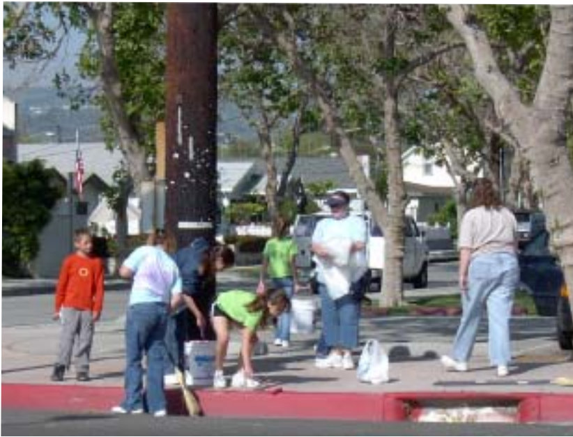
Community Volunteers and Scouts spruce up the corner of Narbonne/247th Street