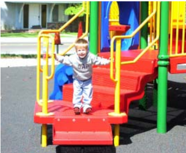
A young Lomitan enjoys the new play equipment

If you passed by Hathaway Park on Pennsylvania and 256th Street in recent weeks, you may have noticed some positive changes. The entire play area has been replaced with brightly colored and attractive playground equipment and protective surface coating. The $59,000 project was funded with a parks grant (Roberti-Z'Berg Harris). This program funds high priority projects that satisfy the most urgent park and recreational needs in California, with emphasis on unmet needs in the most heavily populated and most economically disadvantaged areas.