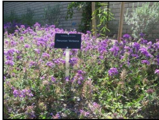
Lomita Drought Tolerant Garden Peruvian Verbena 26255 Appian Way