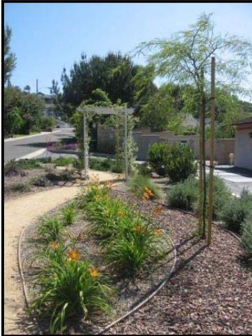
Lomita Drought Tolerant Garden 26255 Appian Way